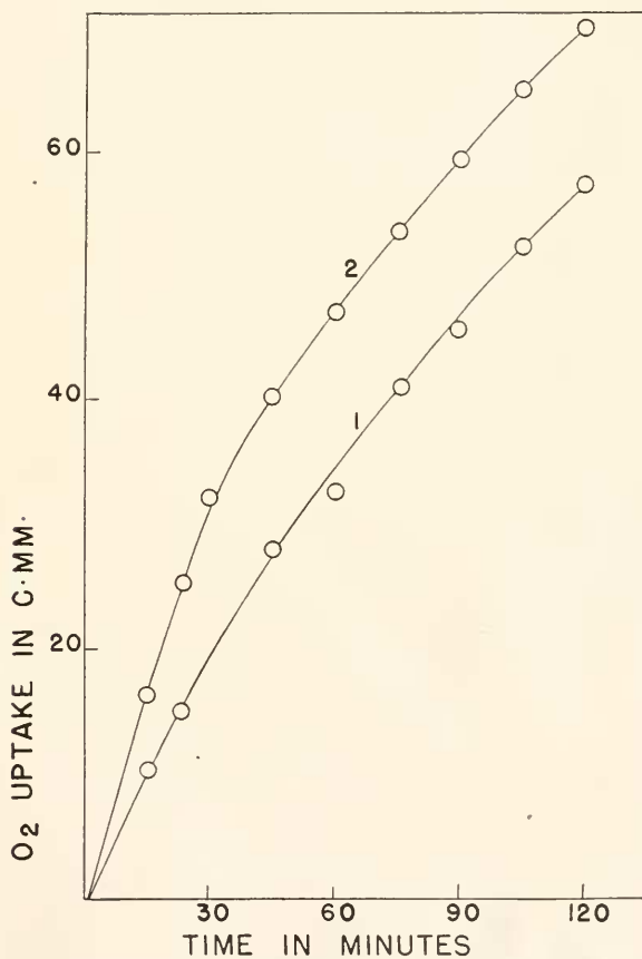
FIGURE 2. Effect of H 2 O 2 on the respiration of fertilized sea urchin eggs. H 2 O 2 concentration, 1 \times 10^{-4} M; 1. Control; 2. H 2 O 2 .